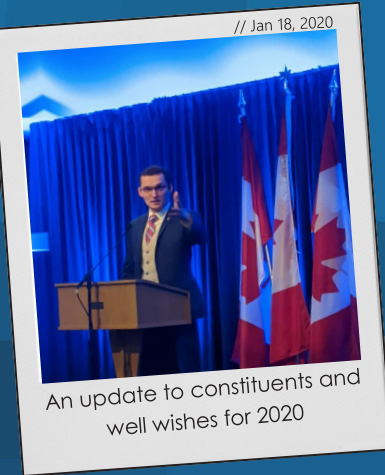
An update to constituents and well wishes for 2020