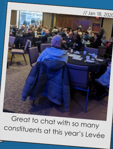
Great to chat with so many constituents at this year's Levée